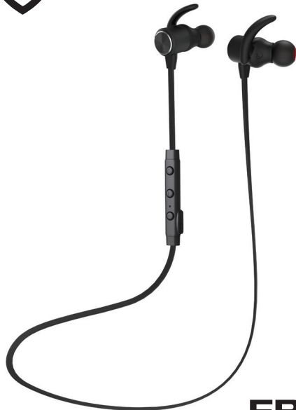
EBT6 BLUETOOTH EARBUDS